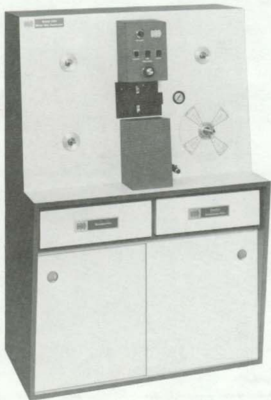
MODEL 3100 WITH 16 mm VACUUM HEAD.

The Model 3100 and Model 3150 are free standing units, caster mounted for mobility and ease of maintenance. Both have two storage drawers, one of which is light-tight for storing unexposed film. A large storage space is beneath.